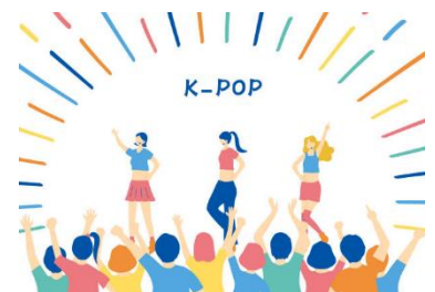
FUN & RICH CULTURAL EXPERIENCE